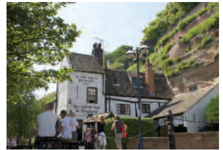
Ye Olde Trip to Jerusalem